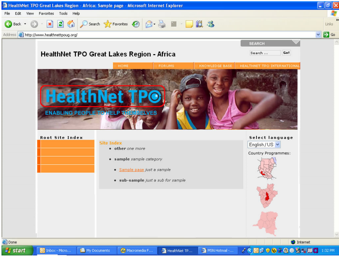
Main Website mock-up template note* final product may vary from the above generated template